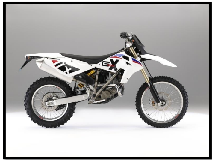
AL. Engine Guard EC BMW G 450 X 2009-10 Ref: 2CP0590081