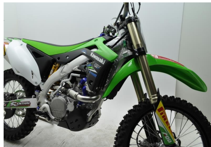
Radiator Guard KAWAZAKI KXF 450 2012/15 Ref: 2CP0600089