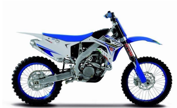
Radiator Guard TM 250 FI 2015 Ref: 2CP0600148