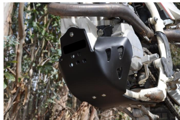
Engine Guard DTC-EC HUSQVARNA TE TC 250-310 – 11/12 Ref: 2CP0850078