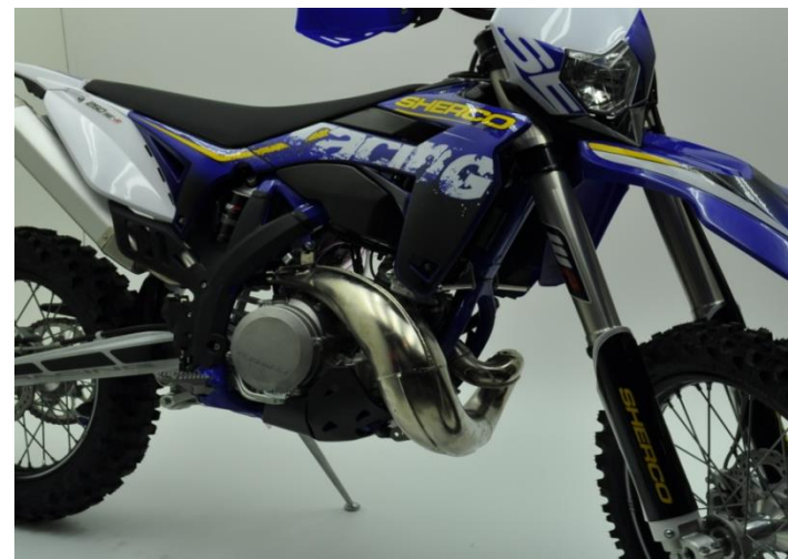
Engine Guard DTC-EC SHERCO 250-300 2T 14/15 Ref: 2CP0850099